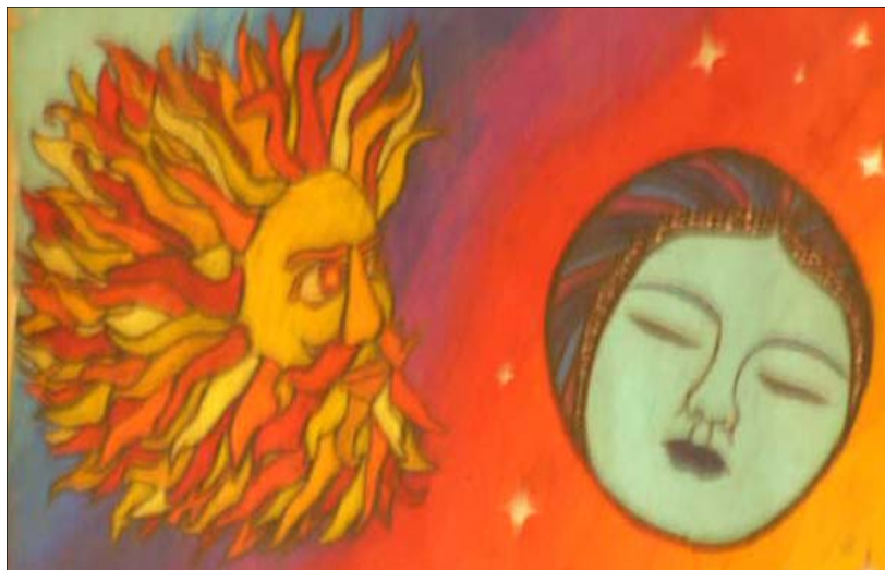
Drawn By Filna Costales