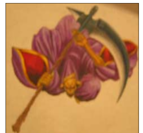
Drawn By Samuel Saputra